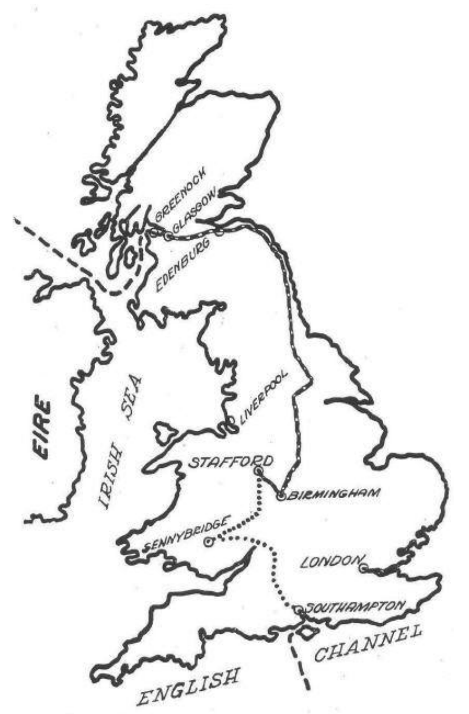
ROUTE TRAVELED THROUGH UK

The exterior of the building of brick construction, three floors in height, appeared most prepossessing to the eyes of the soldiers just arrived—certainly (however high regarded an American unit in the estimation of the English) no such building could be their temporary home! Just such a building could be their home! Yes, it was true, yet alas, what a rude awakening!!